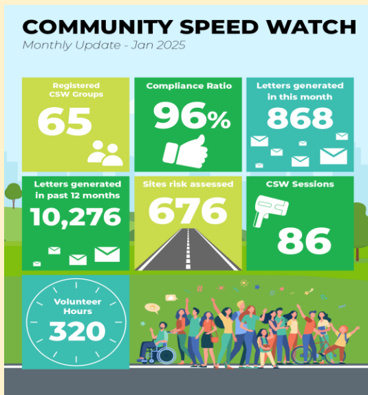
Table - Surrey Roadsafes, Posted on Friday 28th February 2025 in Community Speed Watch , Speed

So if you enjoy fresh air, being outdoors, the sense of camaraderie, and making your neighbourhood a safer place, why don't you consider volunteering: you can find out more about Community Speedwatch by accessing https://www.communityspeedwatch.org , and if interested, register following the prompts on the menu.