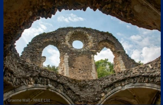
Graeme Wall - NHLE List

Heritage crime can include offences such as lead theft from churches, damage to ancient monuments and illegal metal detecting. Heritage crime may also include breach of planning rules related to listed buildings, but this is dealt with by the council planning control and not the police.